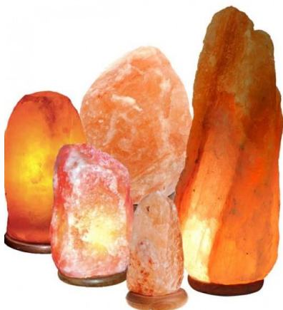
Himalayan Salt Lamp