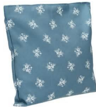
Herbal Sleep Pillow