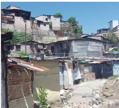
(Left) Poverty in the neighborhood of San Miguelito, where Resurrection is located.

To inquire about a stock donation, change or cancel the online giving arrangement anytime by contacting Pilgrim Lutheran Church at 773-477-4824.