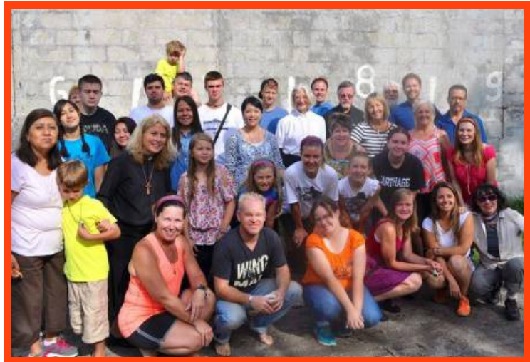
We were blessed to lead a Group of 71 people this year.