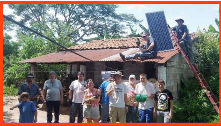
Pilgrim's Solar Project, bringing light to rural homes